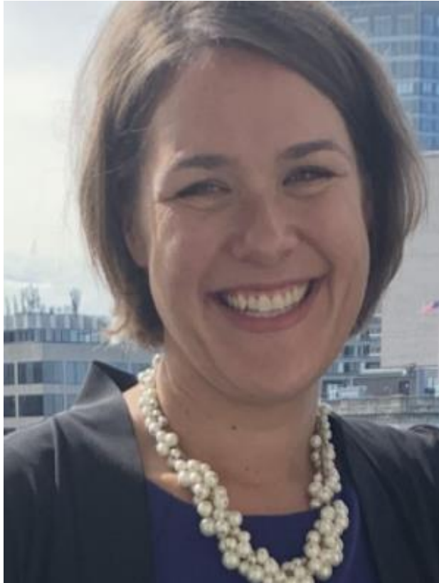
Samantha Aigner-Treworgy EEC Commissioner